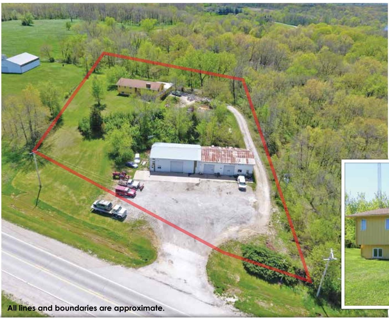
All lines and boundaries are approximate.