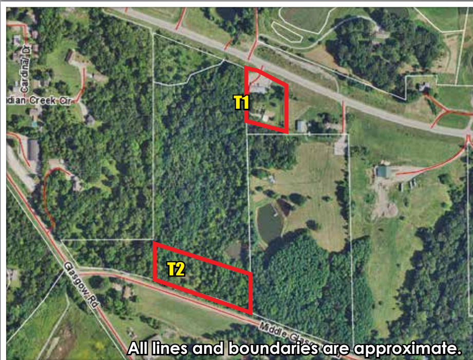
All lines and boundaries are approximate.